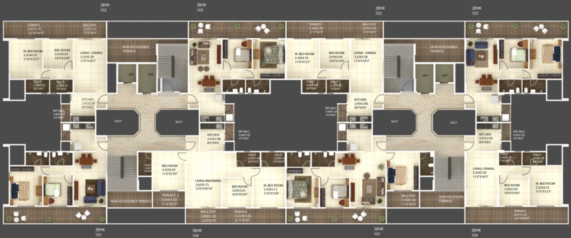
TYPICAL FLOOR PLAN - BUILDING A6