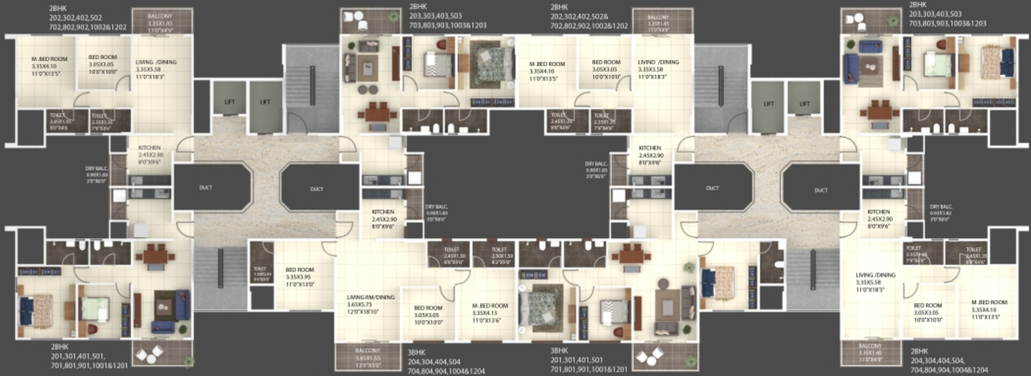
TYPICAL FLOOR PLAN - BUILDING A6