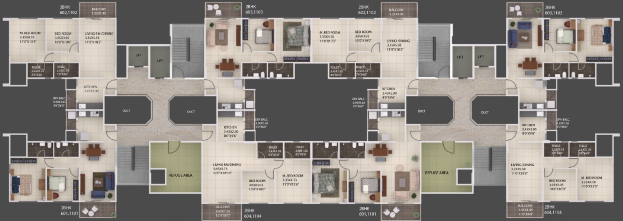
REFUGE FLOOR PLAN - BUILDING A6